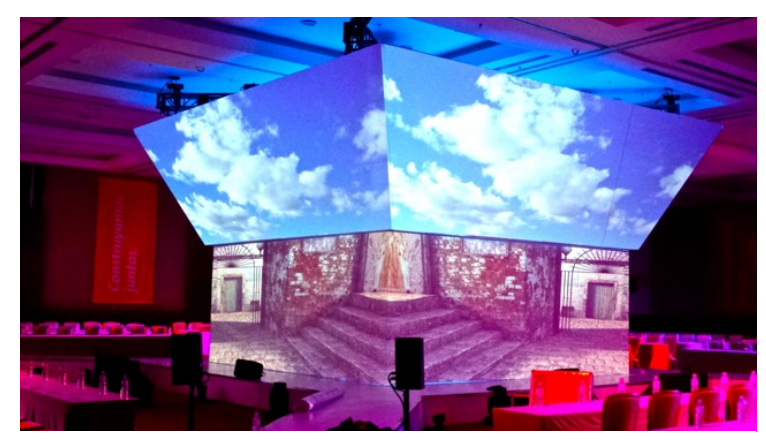
Mapping and video tracking

Simply Professional created content for the background, but the presentation and the video tracking / mapping were all live. For the video tracking, the company used an infrared camera attached to a Millumin server to track the position of the bottom of the pyramid.